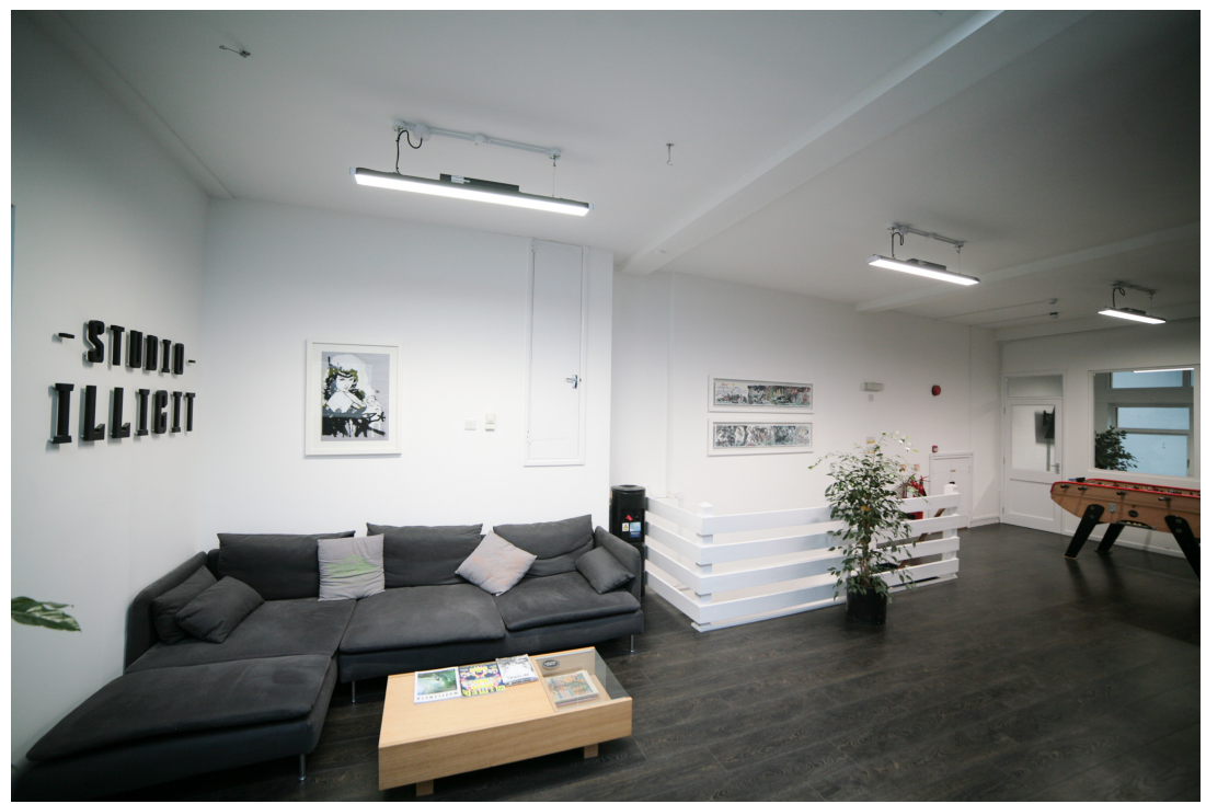
Break out area

The McCoy's is on the North side of Fore Street, near the junction with Bartholomew Street & West Street. This historic area called the 'West Quarter' is known for its individual retailers which include Fashion/Designer/Retro-Clothing, Music, Musical Instruments, Arts & Crafts, Games, & Gifts. Pubs, Restaurants & the Picture House, complete a lively and varied street scene.